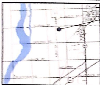
THE ESTATES AT WYNNWOOD